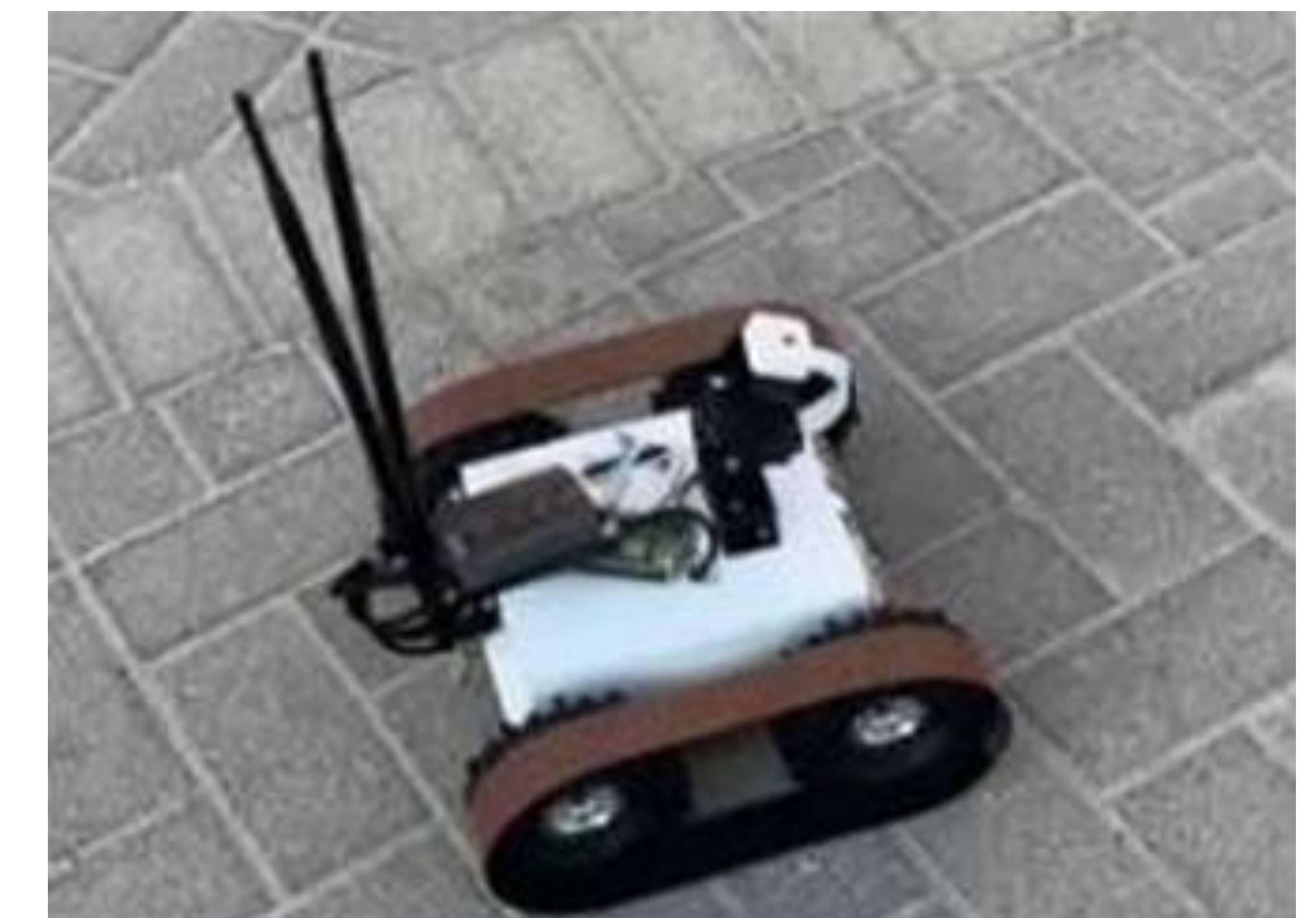
• Prototype & Testing